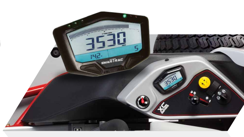
SmarTrac™ Monitoring System features a tachometer and resettable hour meter, with alerts for low oil pressure and overheating.

Two 7-gallon tanks mean fewer stops for refueling.